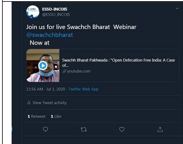
Inauguration of Swachhta Pakhwada at INCOIS live on twitter