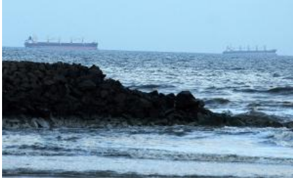
India, along with 23 other countries, is participating in a major Indian Ocean-wide mock tsunami drill on September 9 and 10.

HYDERABAD: India, along with 23 other countries, is participating in a major Indian Ocean-wide mock tsunami drill on September 9 and 10 that is aimed at testing the Indian Ocean Tsunami Warning and Mitigation System (IOTWS).