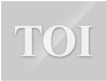
A file photo of Marina beach in Chennai

The mock drill would simulate tsunamis originating from two earthquake sources on successive days, one in the eastern Indian ocean and the other in the north-western Indian ocean.